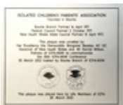
Celebrating 50 years of Isolated Children's Parents Association (ICPA) achievements at its Bourke birthplace.