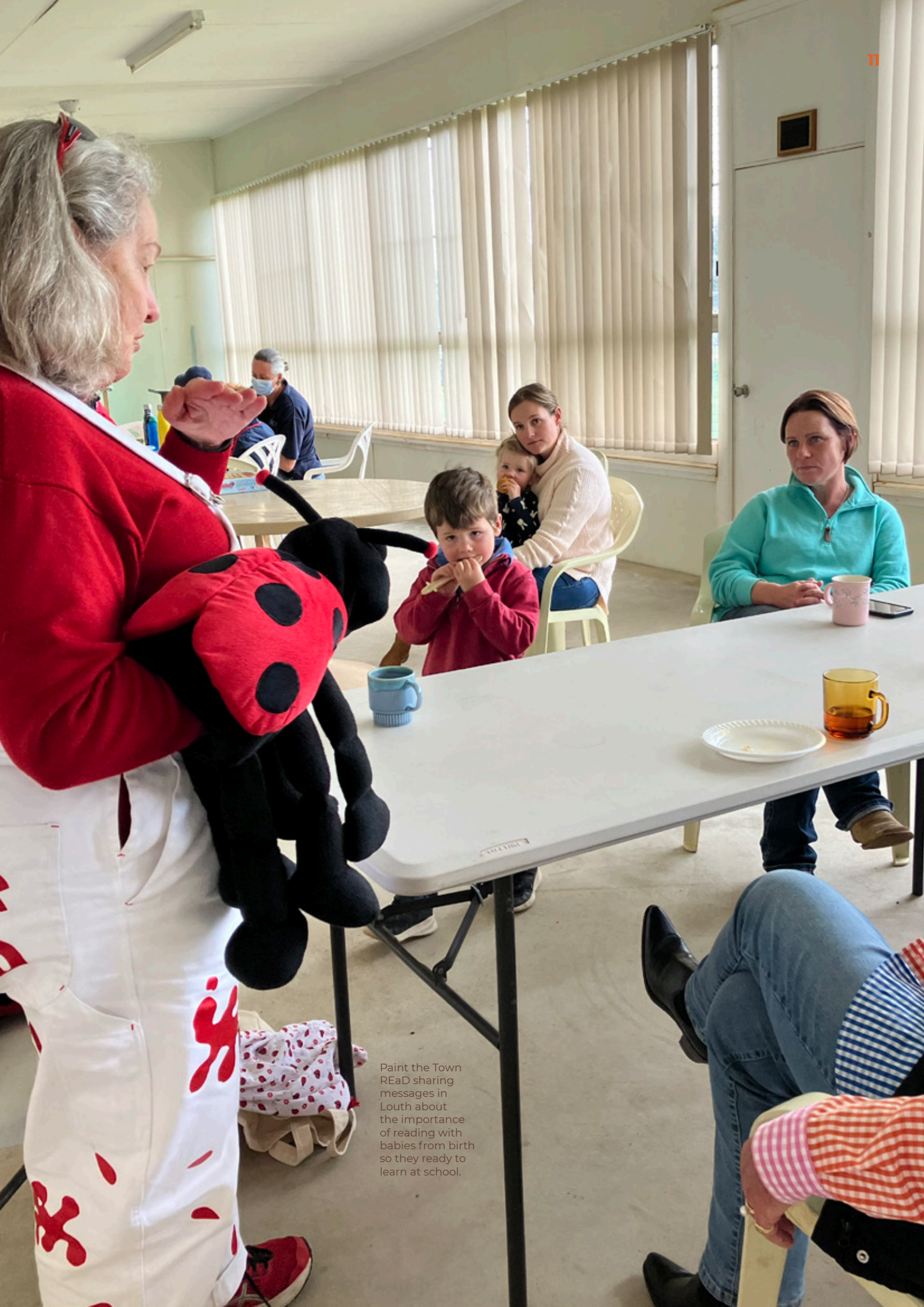
Paint the Town REaD sharing messages in Louth about the importance of reading with babies from birth so they ready to learn at school.