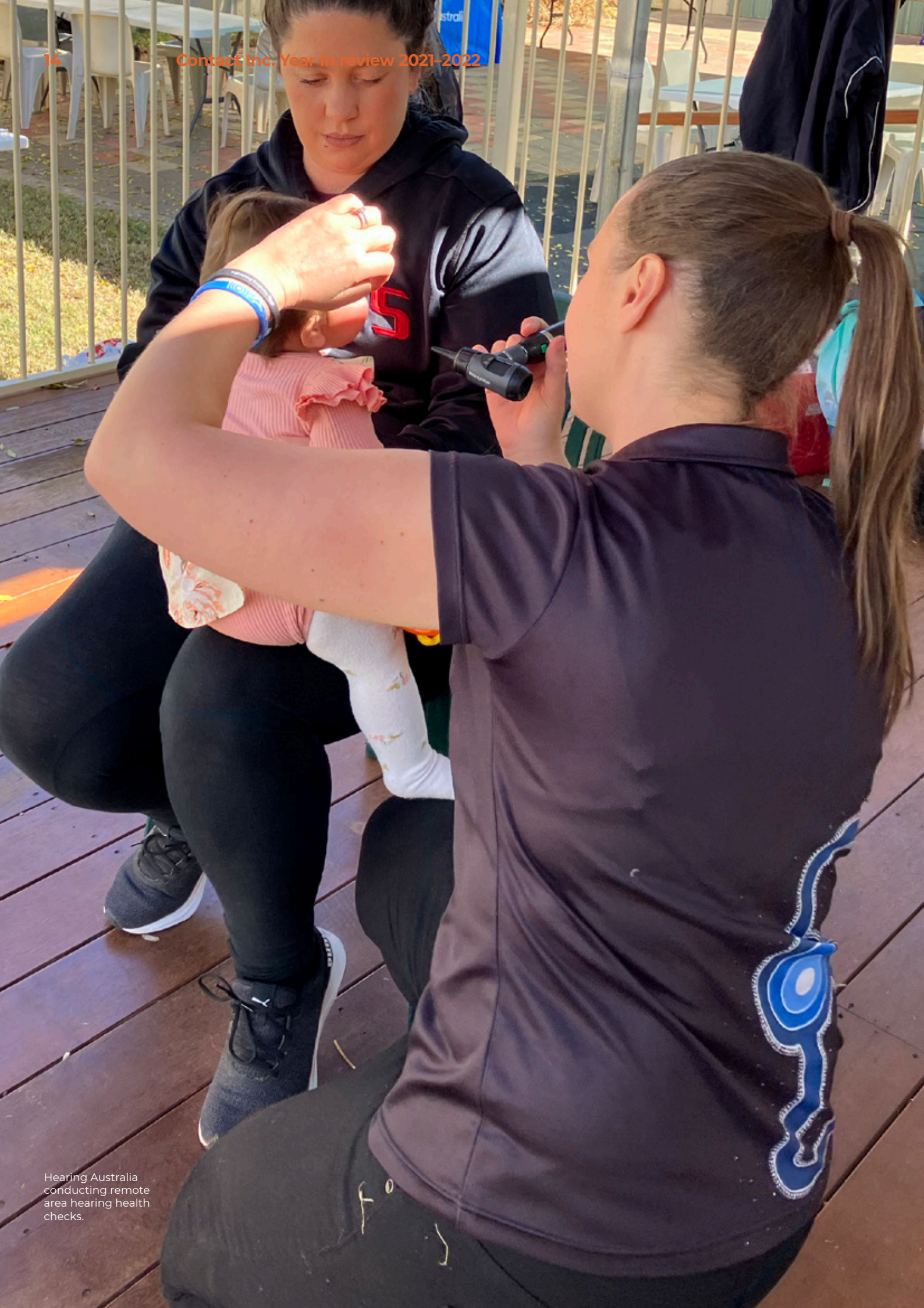
Hearing Australia conducting remote area hearing health checks.